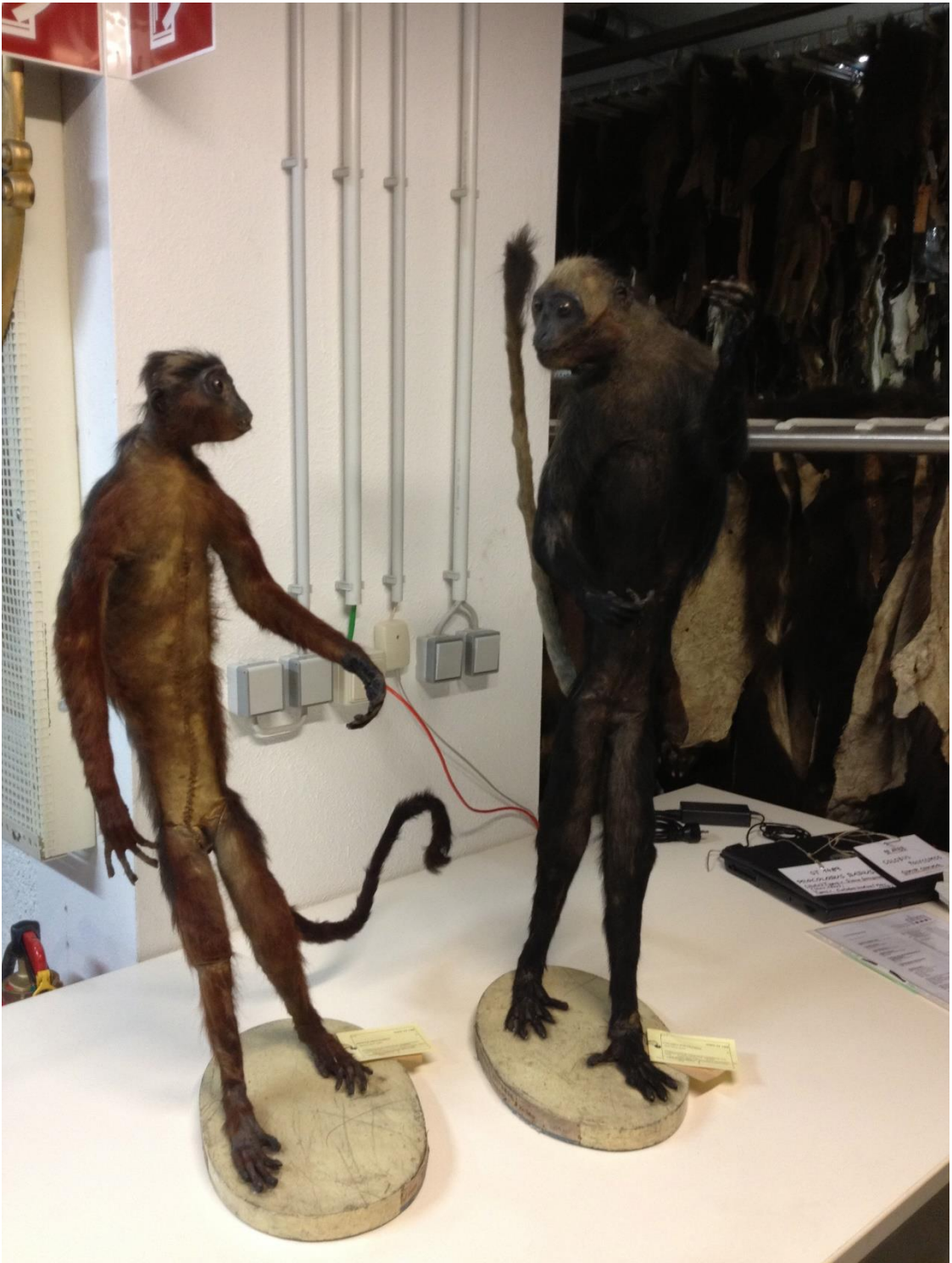
Fig.2 King Colobus monkey (Colobus polykomos) and Western Red Colobus monkey (Piliocolobus badius); author's photograph, courtesy of the Vienna Natural History Museum.