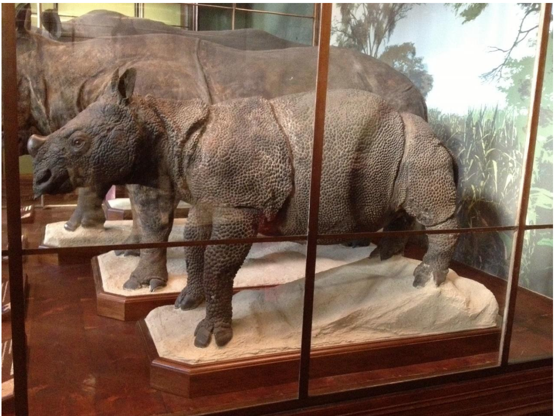
Fig. 1 African Rhinoceros, 1800; author's photograph, courtesy of the Vienna Natural History Museum.

posed behind wavy, pre-industrial glass in giant timber cases. One of the earliest specimens on public display is a rhinoceros, dated 1800. The pitfalls of reconstructing exotic animals at this early stage can be seen in the fact that its rear legs are much shorter than those in front, necessitating a mount raised at the back so that the rhino can stand level. (Fig. 1) The taxidermied monkeys I was about to meet in the NHM's nether world of scientific research predated this odd-looking beast, but they must have been passable in appearance because they were purchased by Count Leopold von Fichtel, along with half of Lever's collection, for the NHM's precursor, the 'Vereinigte K. K. Naturalien-Cabinete'.