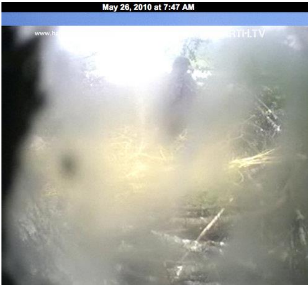
Fig. 2 Screenshot Sidney Cam, Hancock Wildlife Foundation, May 26, 2010, 7.47 am

The live views of the birth of a bear cub on North American Bear Center's den cam hardly showed more than the mother's moving backside. All the same, it had the intended effect of turning viewers into bystanders of the actual birth of the cub.