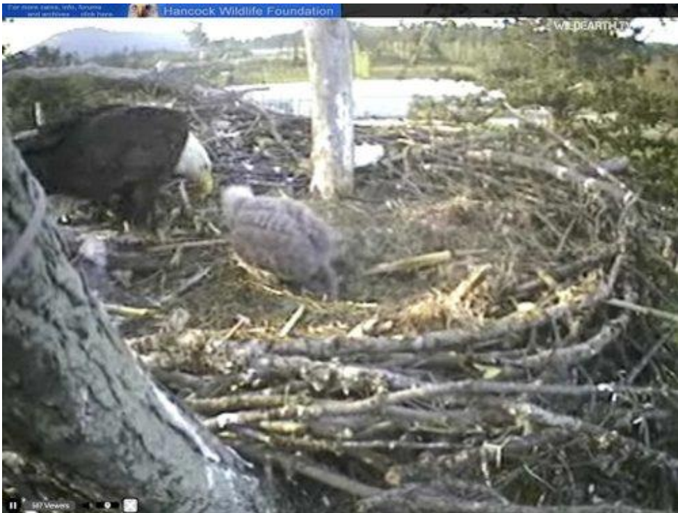
Fig. 1 Screenshot Sidney Cam, Hancock Wildlife Foundation, May 04, 2010, 7.04 am

Forum discussions on the websites demonstrate that users are interested in information about the places shown. This is not surprising when one realises that the most exciting aspect of webcams is not the representation of animal life. In many respects, film does that much better. What web cameras add to the media landscape is the power to connect viewers to animal habitats in real-time. This connection operates despite the generally low quality of the visuals. Compared to film, views are grainy and often choppy. Lenses get fogged by rain. Animals are only partly in focus or block the view with their bodies.