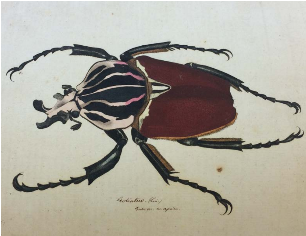
Figure 3. Goliathus , drawn by Moses Harris in 1767, published Dru Drury, Illustrations of Natural History vol. 1 (London: Printed for the Author, 1770), Plate 31.

The grub of the Goliath beetle, for instance, was regarded as an especially fine food morsel in Africa, as was the female cricket ( acheta membranacea ) which African children would dig out of the ground in the right season, when she was full of eggs. They would roast the whole animal but eat only the eggs, 'which are contained in one bag, and resemble part of the roe of a large fish, deeming it very delicate food'. 21