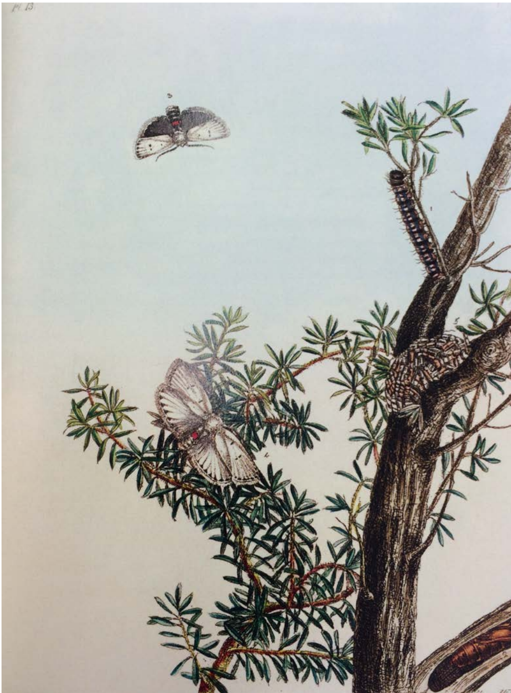
Figure 4. Bombyx Crytophasa , in Prodromus Entomology. Or, a Natural History of the Lepidopterous Insects of New South Wales. Illustrated with Nineteen Plates. By John William Lewin, A. L. S. First published in 1805, reissued in 1822, and now republished by Edition Renard, Melbourne, 2007, Plate 13.