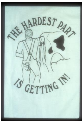
Fig. 3 Vet School T-shirt.

When a vet school sells a t-shirt that says, 'The Hardest Part is Getting In', showing a man elbow-deep in a cow's vagina (fig.3), they are talking about more than forced artificial insemination. Pharmaceutical companies sell their products with images of sexy chickens who desire to be consumed (fig. 4), and cows who need to stay pregnant (fig.5). They, too, are talking on several levels at the same time: the idea of women's bodies as sexually consumable and available for pregnancy haunts these images.