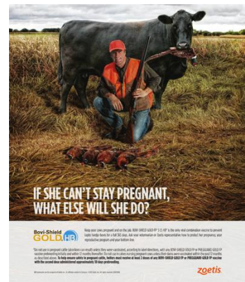
Fig. 5 Pharmaceutical ad.

As long as we do not examine the products of female torture and servitude that we consume every day and feed to others, we will leave unexamined the ways that gender oppression is intensified and justified by the treatment of these powerless and exploited females. We will continue to support an institution that teaches objectification, distance from the victim, and violence in service to personal desires – are not these also the attitudes that contribute to sexual violence against women?