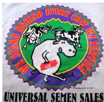
Figure 1. Universal Semen Sales.

A graphic for Universal Semen Sales (fig. 1) pictures a grinning cartoon bull, two lipsticked cows in the background spreading their hind legs and presenting their backsides, and the slogan, 'We Stand Behind Every Cow We Service'.