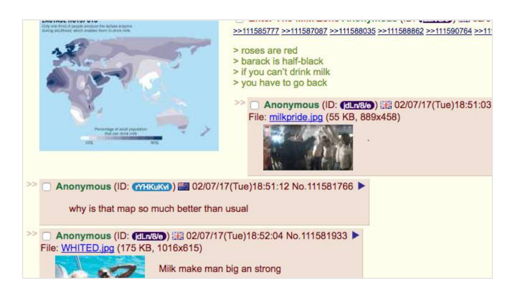
Fig. 2: 4chan discussion board. (Reproduced in Swerdloff)

Here (fig. 2) is a screen shot from a conversation on '4chan,' an online discussion board dominated by the 'alt-right:' (Please note: the following screen shot includes racist hate speech.)