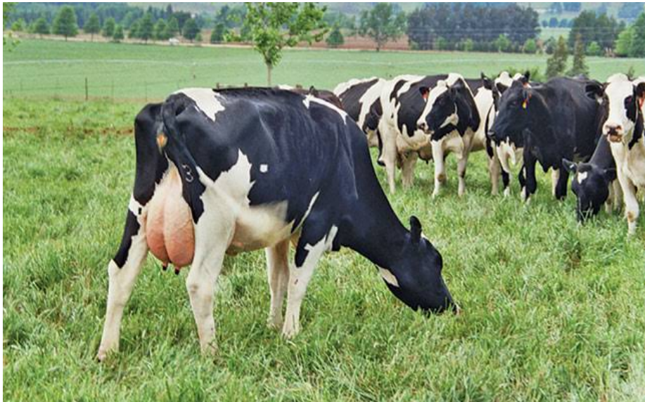
Fig. 7: Modern Dairy Cow. Alan Harman, 'New Zealand Clamps Down on Dairy Cow Ownership', Farmers Weekly, 10 May 2018. https://www.farmersweekly.co.za/agri-news/world/new-zealand-clamps-dairy-cow-ownership/

By comparison with the Aurochs, the first thing to note about the modern dairy cow is her black and white colour, characteristic of the Holstein or Friesian-Holstein breed. This is a relatively recent development. In Australia in the 1950s the most common dairy cow was the Jersey, which produced high fat, rich milk but could not compete in volume with the Friesian. Breeds like the Jersey, Guernsey and Ayrshire soon lost favour and herds were replaced with the high volume Friesians and more recently the Holsteins. Next you notice the very large udder and compare it with the much smaller organ of the wild cow or the cow raised for beef. And finally we notice the body shape and type. There is very little muscle, often with bones showing, and the cow can appear to be undernourished. Most of these characteristics are visible in the illustration above, an ‘idealised’ picture of the Holstein cow (fig. 6). The cow can appear unwieldy, bony, and walk awkwardly because of the huge udder hanging low between her back legs (fig.7).