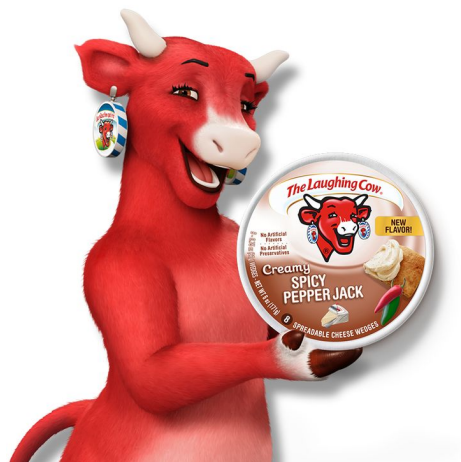
Fig. 1: ‘The Laughing Cow’. Le Groupe Bel. https://www.pinterest.com.au/pin/452259987559305451/

The dairy industry has largely been successful in presenting itself as trustworthy and milk as a non-harm, ‘natural’ product. Images and messages from industry bodies and marketing campaigns have traditionally presented the dairy cow as a contented creature, living a natural life and willingly providing us with her excess milk. Some images go further to suggest that the cow actually enjoys the process (fig. 1). 1 In this paper I use the Marxist concept of ‘naturalistic mystification’ to deconstruct this image through a comprehensive examination of the way that we humans have intentionally designed her, for our own purposes and to her detriment, through the use of selective breeding and reproductive technology. My aim is to challenge the ‘common-sense’ knowledge that presents both the dairy cow herself and her product, milk, as both natural and good. The dairy industry as a capitalist enterprise deals in ‘commodities’ and has as its primary motivation profits and growth. In Australia, it is supported by large government subsidies, much of which ends up as profits for processors and large companies. As a result, the modern dairy cow and her milk, rather than being seen as ‘natural’, should be seen as the creation of human intention, effort and the application of technology, for the purpose of designing an animal for exploitation and profit.