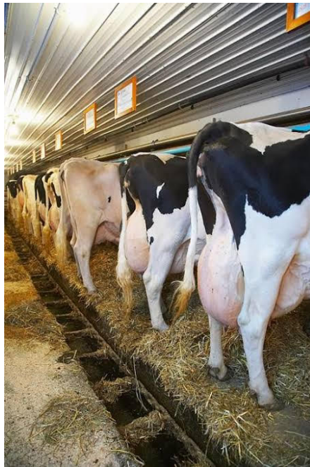
Fig. 11: Modern Dairy Cow. Mika Belle, 'Big Shots Discuss Raw Milk Behind Closed Doors', Boise Weekly, 10 March 2010. https://www.boiseweekly.com/CityDesk/archives/2010/03/10/big-shots-discuss-raw-milk-behind-closed-doors

Meanwhile for the dairy cow, the concentration on high volume milk yield has contributed to a loss of fitness and an increased predisposition to numerous, serious health problems which often result in an early death. All of these cause great distress and suffering to cows on a regular, routine basis (Webster 134). The modern dairy cow is not commonly a robust looking muscular animal. In fact, it is likely that the dairy cow will look undernourished, thin and will be carrying very little muscle. This is the cost of the large udder and the requirement to produce large volumes of milk on a regular basis. So much calorific energy is demanded for this that there is often no excess for fat or muscle for the cow herself (fig. 11).