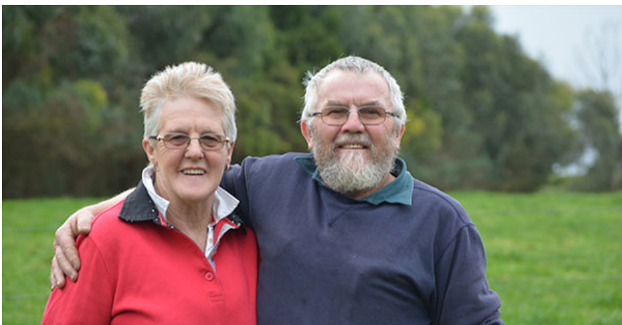
Fig. 13. Dairy farmers. Dairy Australia 'Legendairy' Campaign.