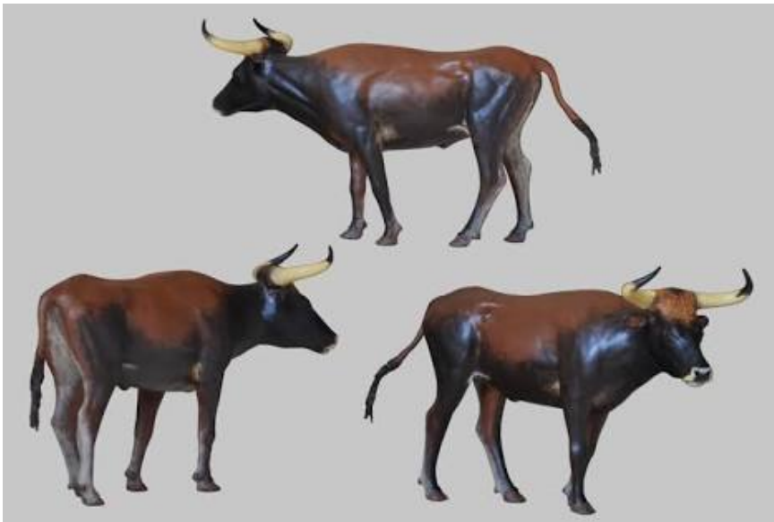
Fig. 4: Aurochs model based on the Sassenberg specimen. Danial Foidl. http://breedingback.blogspot.com/2014/05/

The first evidence of human contact with Aurochs ( Bos primigenius , the original wild ox, fig. 4) can be seen in European cave paintings (Leroi-Gouran 8). In the Lascaux caves in south-west France (decorated in about 17,000 BC), Aurochs are the most frequently depicted animal. The Aurochs was a large, squarely built animal with large, heavy horns, which grew up to two metres long (fig. 5). The body was dark in colour, solid and sturdy as well as being fierce fighters and 'swift footed' (Velten 16). They continued to survive in Europe, Asia and the Middle East and we have evidence from a DNA study which suggests that all domesticated cattle originated from about 80 wild Aurochs who lived in Iran 10,500 years ago (Bollongino et al.). The last recorded live Aurochs, a female, died in 1627 in the Jaktorow Forest in Poland. The causes of extinction were widespread, unrestricted hunting, loss of habitat, and diseases transmitted by domestic cattle (van Vuure). The Aurochs gained the dubious honour of being the first documented case of extinction (the second being the dodo).