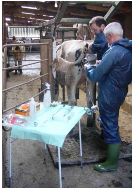
Fig. 8: Embryo Transfer.

More recently, embryo transfer has been used to enable the multiplication of progeny from 'elite', high performing cows. These cows are given hormones to enable them to produce multiple embryos. These are then 'flushed' from the cow's uterus and 7-12 embryos are consequently removed from the donor cows and transferred into other (inferior) cows that serve as surrogate mothers. This is performed either through surgical or nonsurgical (trans-vaginal) collection procedures, most commonly the latter (fig.8). The 'donor' is constrained in a crush, usually with head-bail restraint and 'usually' with an epidural anaesthetic. This not given for pain relief as a non-surgical technique is seen to be 'non-painful', but is given for 'ease of manipulation of the tract' (NSW Department of Primary Industries).