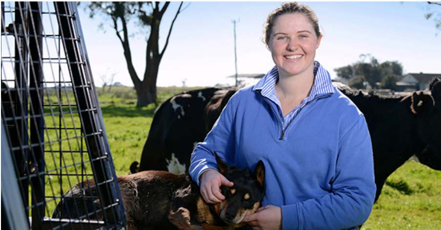
Fig. 14. Dairy farmer. Dairy Australia 'Legendary' Campaign.

Dairy Australia also aims to increase the proportion of teachers who deliver 'positive dairy messages' to students through their Primary Schools Engagement Plan and to increase the proportion of 'dairy positive messages' heard by consumers from health professionals. There is no mention of marketing to counter unpleasant information regarding the deaths of bobby calves, nor the serious health and welfare issues outlined above, only silence and the presentation of a partial, selective and idealised story. It should also be noted that Dairy Australia's marketing and promotion budget is almost a quarter of its annual grant from the government, supposedly for research and development. The mystification of the dairy industry is an expensive and ongoing business and we are paying for it.