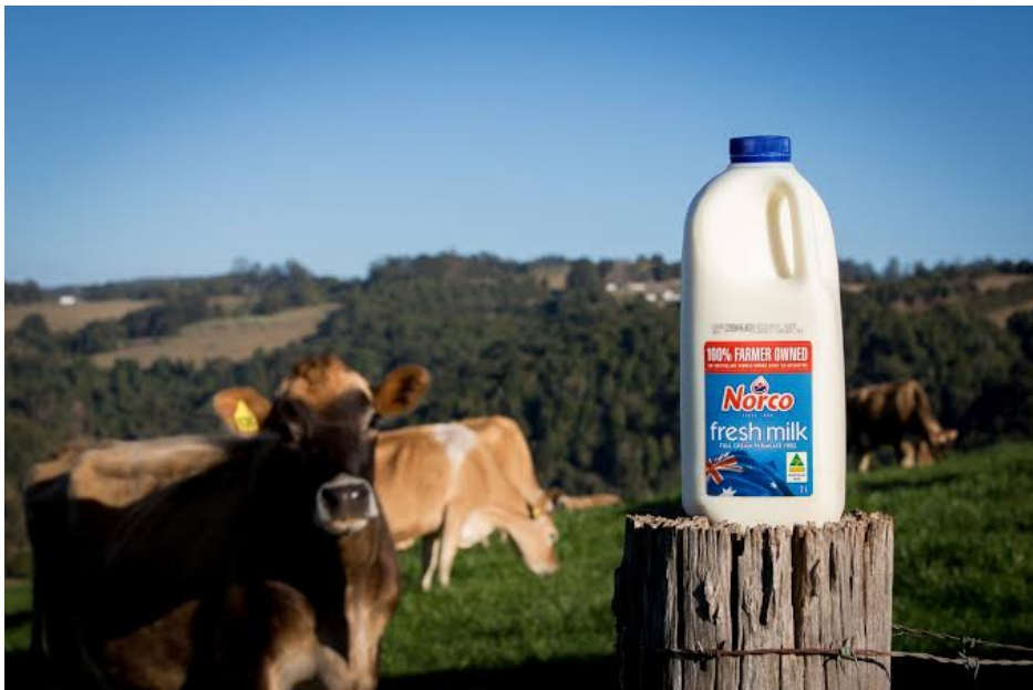
Fig. 10: 'Voted Australia's Favourite Milk'.

http://australiasownfoods.com.au/products/australias-own-full-cream-dairy-milk/