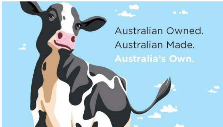
Fig. 9: Australia's Own Milk.

http://australiasownfoods.com.au/products/australias-own-full-cream-dairy-milk/