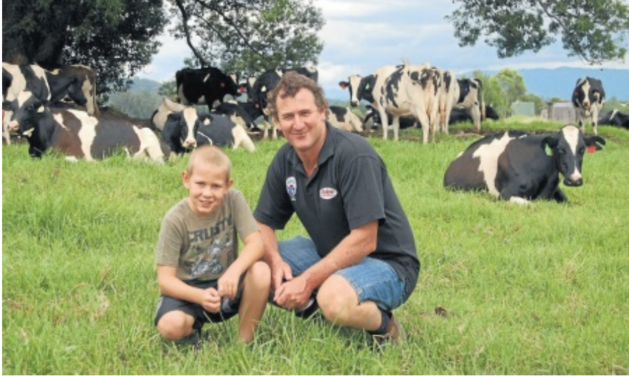
Fig. 12: Dairy farmer and child. Shan Goodwin, 'Value Add Key to Farm Growth', The Australian Dairy Farmer, 6 February 2014. http://adf.farmonline.com.au/news/magazine/farm-business/general/value-add-key-to-farm-growth/2687066.aspx

'dairy people'. This process has already begun with increasing emphasis in marketing material on positive images of dairy farmers and their families (figs. 12-16).