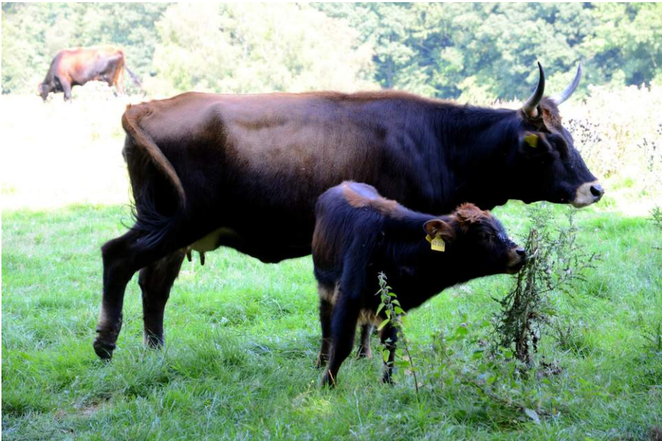
Fig. 5: Modern Aurochs. TaurOs Programme.