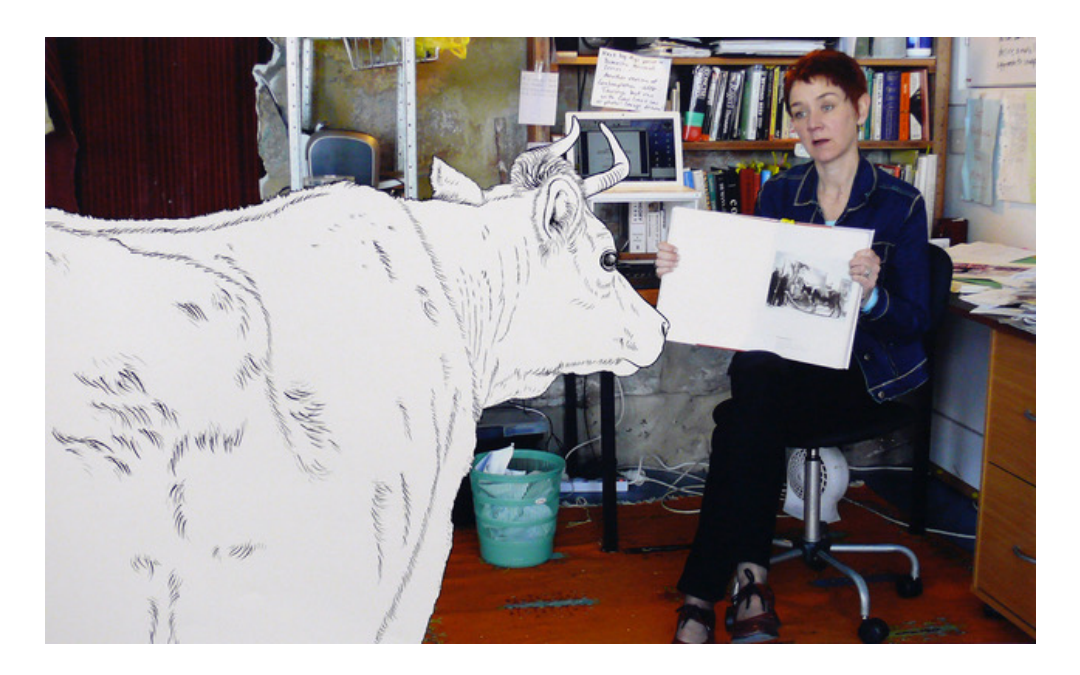
Yvette Watt, Domestic Animals (scholarly explanation) , 2008, giclee print and ink on paper, 80 x 130cm. Courtesy of the artist.

What is it that changes, for the cows, such that this active investment in working together becomes visible? Thinking that farmers and cows share the conditions of work – and, following Donna Haraway, this proposition could be extended to laboratory animals – shifts the way that this question is generally opened and closed. This obliges us to think of beasts and people as connected together in the experiment they are in the process of living and through which they together constitute their identities. ... If animals do not cooperate, the work is impossible. There are not therefore, animals who 'react'; they react only if one cannot see anything other than a mechanical functioning. In operating this shift, the animal is no longer properly speaking a victim ... (Despret, What Would Animals Say 182)