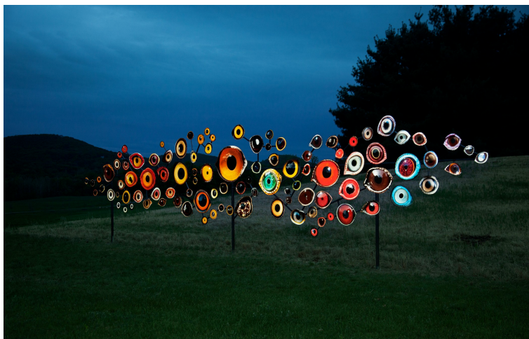
Fig. 2. Jenny Kendler, Birds Watching I , 2018.

Now more than ever, assessing and representing the wicked problem of how humans are interfering in natural processes is work that must involve the collaboration of scientists and artists. With extinction denialism on the rise (Lees, et al.), visual artists and other creatives are needed to communicate the scope of the problem. In her Birds Watching series of installations, Jenny Kendler works with data from the National Audubon Society in the U.S. and conservation scientists from the Zoological Society of London to raise awareness of climate change effects on local bird populations. In recent iterations of this ongoing project, Kendler creates large reflective birds' eyes that seem to 'gaze back' at the viewer (fig. 2).