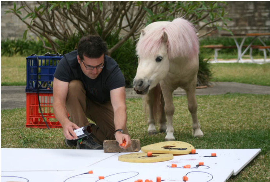
Image 5. Prince takes keen interest in what the human artist is doing prior to making his own marks on the canvas.