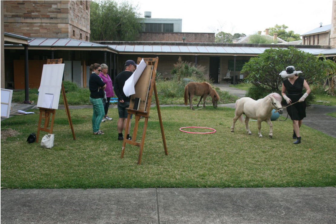
Image 3: Demonstrating using a whip as a pointer rather than a driver for directional communication with Prince.

reinforcement in horse training and the results support a more complex and long lasting learning result from positive reinforcement compared with punitive approaches.