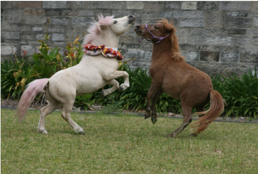
Image 6. Prince and Whinney broke into spontaneous and energetic playing colt (entire male horse) style at the end of the workshop.

The immersive creative workshop method is not suggested to be reserved for horses, but for many species in need of greater care. Pigs and dairy cows would be ideal candidates. Less ecologically charismatic species such as the leech would require other initial attractants, such as nature adventure camps where learning about nature causes humans to ‘take an interest’. It should be noted that the workshop technique moves beyond mere physical proximity to another species. The facilitated process and creative interspecies activities provide crucial opportunities for charisma to act. Representatives of the species might be invited to act on behalf of their kind to share the wonder of being-cow or being-pig, and some who have demonstrated interest to interact with human, could go on to participate.