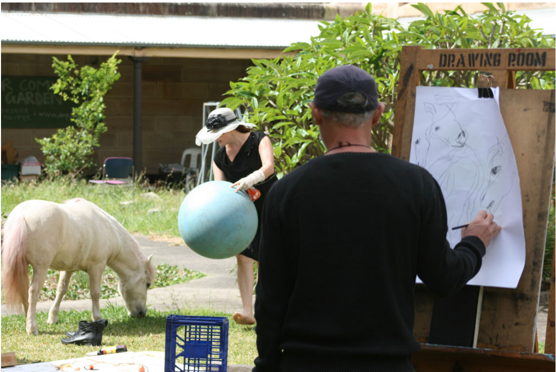
Image 4. Workshop participants were offered the choice of drawing the horses or playing 'soccer' with them.

The next section of the workshop involved no direct physical contact and all participants took part. Four one metre square canvases were placed on the ground together. The human artists painted the canvas with molasses and carrots, and the horses then added to the mark-making by moving across the canvas and licking and pawing at the molasses and carrots. The easy movement into painting with horses was surprisingly rapid, as the interactivity of the horses seemed enthralling to the group and each person wanted to help with mark-making. The 'Painting with Horses' concept had developed during my research process as a way to create a conceptual bridge between art practices and the physical communicative modes of horses. Artist duo Olly & Suzi conduct a practice that similarly undermines and acknowledges art practice as they introduce their simple paintings of animals to wild animals. A spectacular example of their work is their photographic print 'Shark Bight' (1997) that documents a Great White Shark biting their painting of a fish. 3 'The idea is also to get the animals to interact with the work, ideally