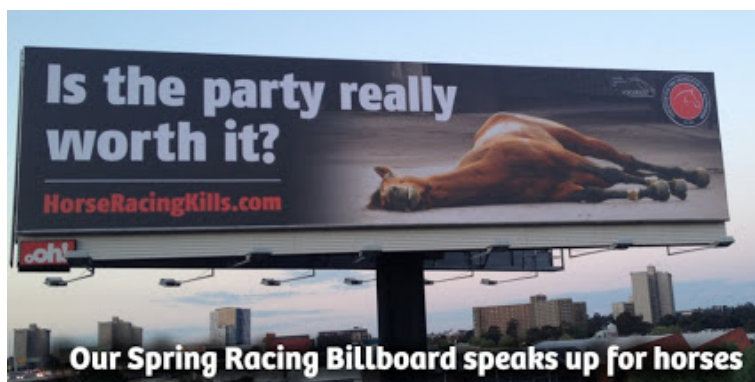
Image 1: Coalition for the Protection of Racehorses billboard in Melbourne shows a fallen, dead racehorse in protest of the 2014 Melbourne Cup.

I felt involved with the movement against cruelty to racehorses at the time of the 2014 Melbourne Cup, albeit acting as an individual in a loose network of interest rather than as a member of an activist group. One such group is the Coalition for the Protection of Racehorses. I followed their social media updates regarding their direct action protests around the Cup. This group operates significantly through the mode of publicly sharing graphic imagery documenting horse abuse and injury during races. They also conduct dramatic protest incursions into racing events. Their intention is to interrupt the continuity of unjust cultural practices. A large billboard depicting a dead, fallen racehorse was put up by the group in Melbourne at a prominent urban location (Image 1) leading up to the 2014 Cup. On the group website http://www.horseracingkills.com more images of horses dying on the track or being slaughtered were displayed. These images are shocking and graphic, portraying as they do acts of extreme violence towards horses. Members of the group attended the Cup dressed to match the glamorous atmosphere, but drenched in fake blood. The group's work has continued over several years. As well as direct action they are striving to have race industry legislation changed through image-based documentation of irresponsible behaviour towards horses within that industry.