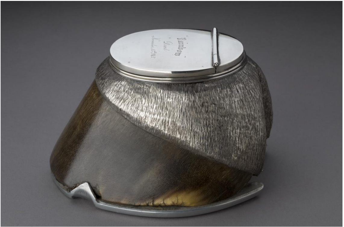
Silver inkwell set into a horse's hoof, inscribed "'Rainbow", died November 13th 1913'. National Museum of Australia.

The exhibition is strongest when horses (as opposed to the humans associated with them) are centrally positioned; for example, both 'On the Farm' and 'Through the City' ask the audience to consider how accommodating horses has physically influenced the layout of these places, such as Melbourne in the 1880s when the city was home to around 20,000 horses. Horse-human bonds are also addressed, most notably in the form of Harrie Fasher's life-sized sculpture depicting a horse and human in mutual contemplation.