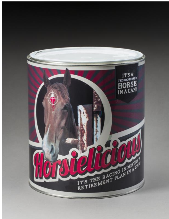
Can of 'Horsielicious: the racing industry's retirement plan in a can', 2014. Donated by the Coalition for the Protection of Racehorses. National Museum of Australia.

Spirited's animal-centric approach is most clearly evinced by the emphasis on equine welfare, incorporated into almost every exhibit – with one notable exception. The ‘At the Track’ exhibit remains conspicuously silent on the issue of racehorse welfare, despite having ample opportunities to draw visitor attention to the darker aspects of this sport. Jumps racing is mentioned, though its banning in all but two Australian states is attributed only to ‘safety concerns’, and there is no discussion of the controversial practice of two-year-old racing, though a 2012 Golden Slipper trophy and hat belonging to successful female trainer Gai Waterhouse are displayed.