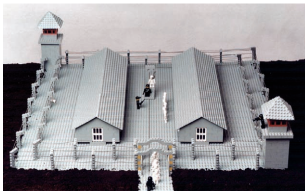
Figure 4. Zbigniew Libera, LEGO Concentration Camp Set , 1996 studio photograph, 20 x 30cm Seven cardboard boxes. Edition of three.