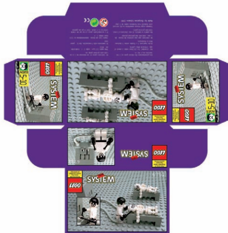
Figure 7. Zbigniew Libera, LEGO Concentration Camp Set , 1996 box design, archive material, 28 x 27cm Seven cardboard boxes. Edition of three.