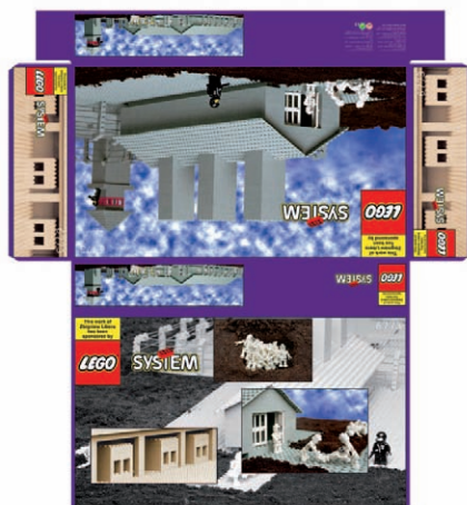
Figure 5. Zbigniew Libera, LEGO Concentration Camp Set , 1996, brick set (box detail), Seven cardboard boxes. Edition of three.