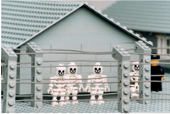
Figure 6. Zbigniew Libera, LEGO Concentration Camp Set , 1996 studio photograph, 20 x 30cm Seven cardboard boxes. Edition of three.