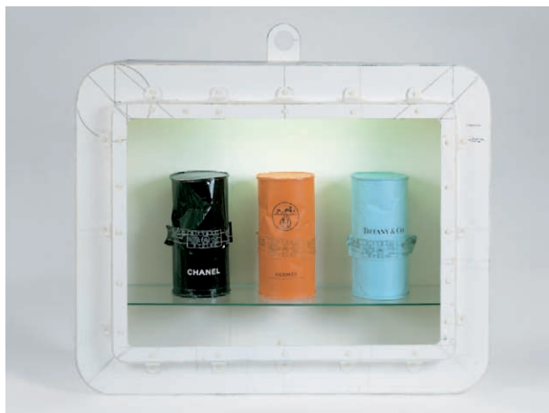
Figure 1. Tom Sachs, Giftgas Giftset , 1998 cardboard, ink, adhesive, foam. 35 x 44 x 12 in. Image courtesy of the artist