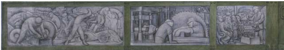
Predella panel from South Wall.