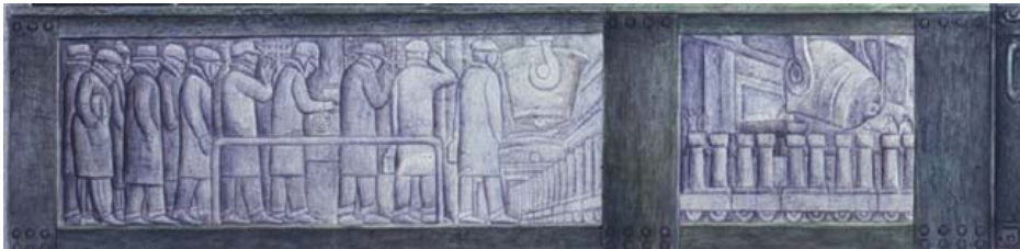
Predella panel from North Wall.