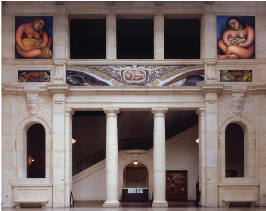
Detroit Industry, East Wall, 1932-1933, Diego M Rivera. Gift of Edsel B Ford.