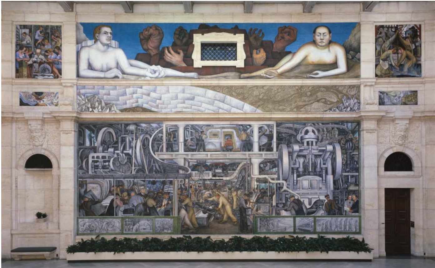
Detroit Industry, South Wall, 1932-1933, Diego M Rivera. Gift of Edsel B Ford.