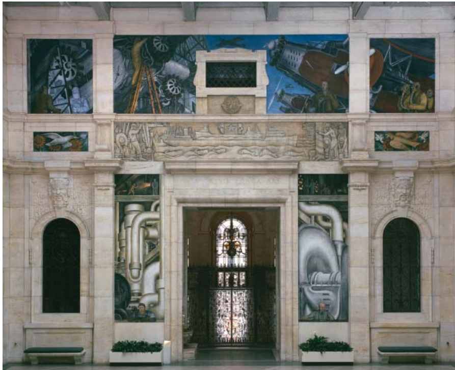
Detroit Industry, West Wall, 1932-1933, Diego M Rivera. Gift of Edsel B Ford.