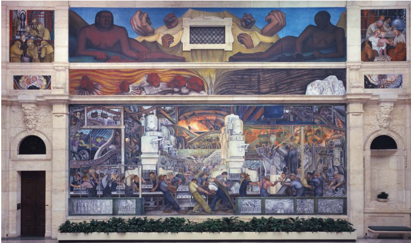
Detroit Industry, North Wall, 1932-1933, Diego M Rivera. Gift of Edsel B Ford.