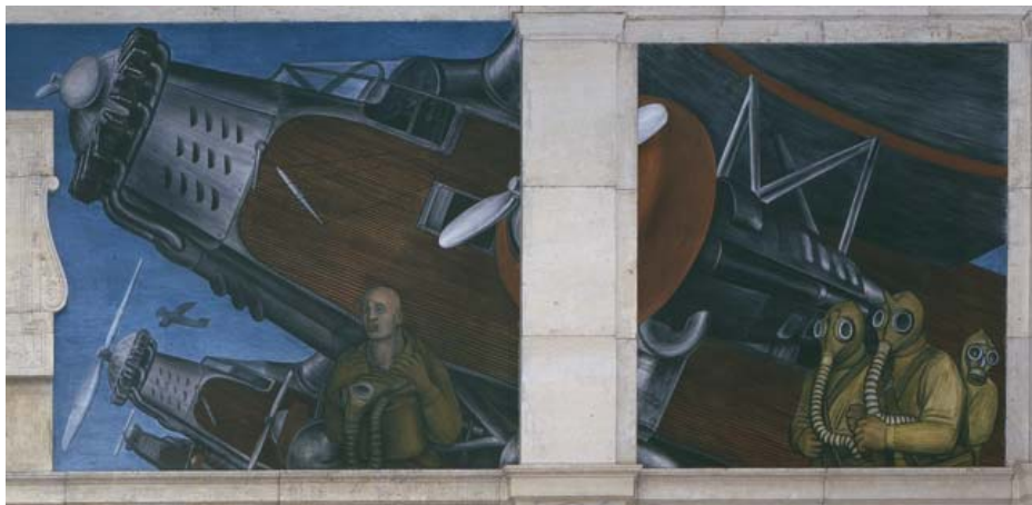
Detail from West Wall, above.