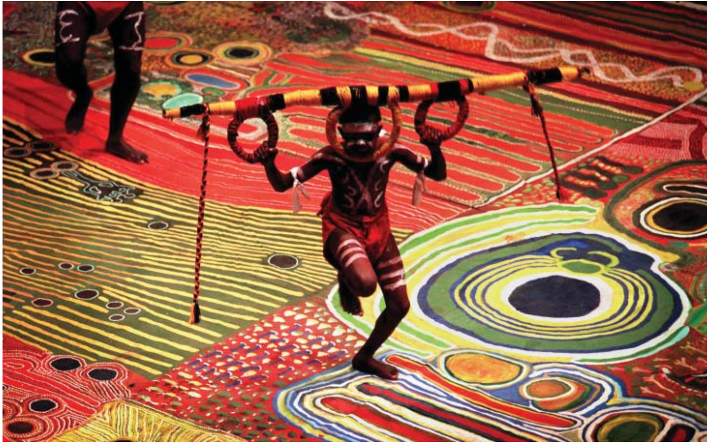
Photograph of Ngurrara Canvas II.