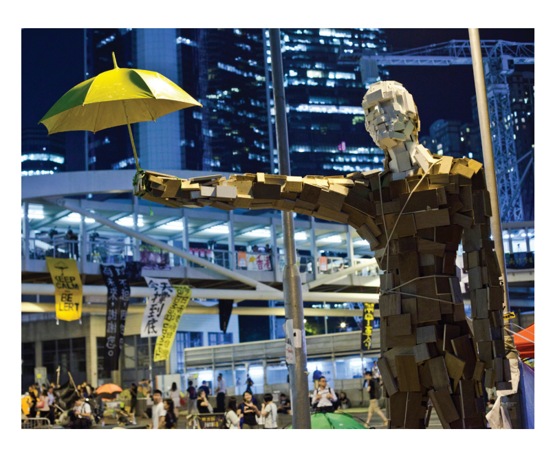
Figure 1: The Umbrella Man: a three metre statue constructed from hundreds of small pieces of wood; created by Hong Kong artist known as Milk.