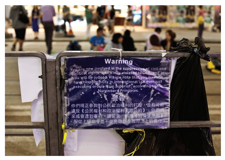
Figure 7: International law versus local law enforcement in an imitation of an official warning sign.