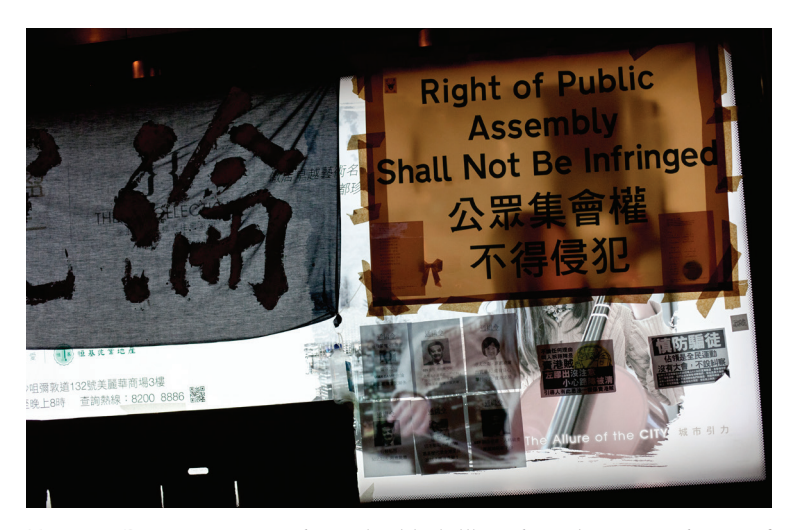
Figure 8: Protest signs taped onto backlit billboards in the occupied zone of Admiralty..