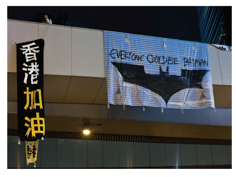
Figure 4: "Everyone Could be Batman": western superhero adopted as a symbol of justice that operates outside the law.