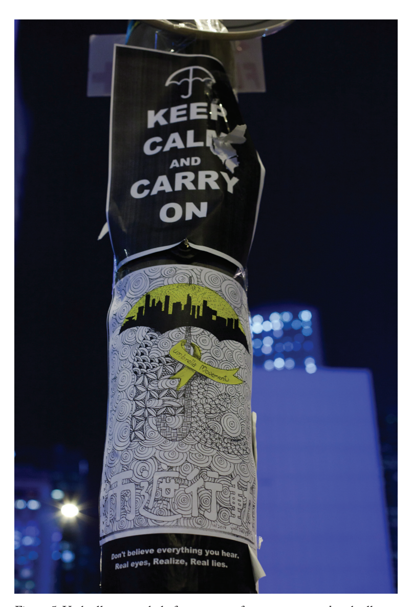
Figure 5: Umbrellas as symbol of movement after protesters used umbrellas to protect themselves from pepper spray and tear gas on 26 September 2014.