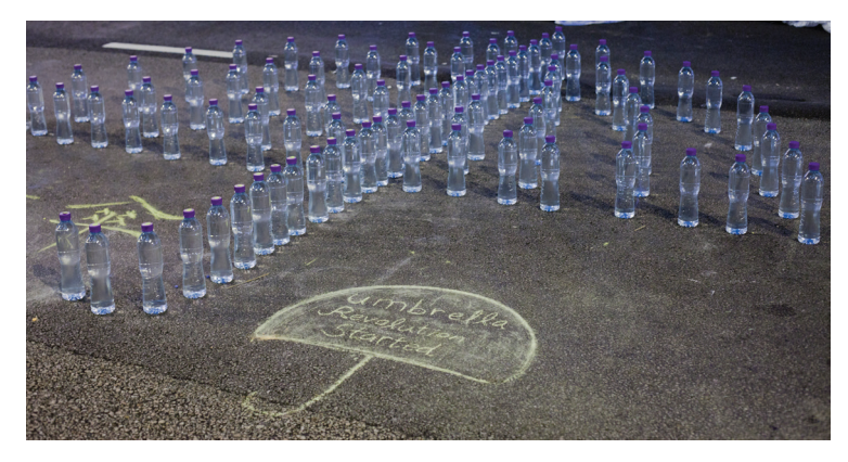
Figure 3: Water bottles arranged in the shape of an umbrella.