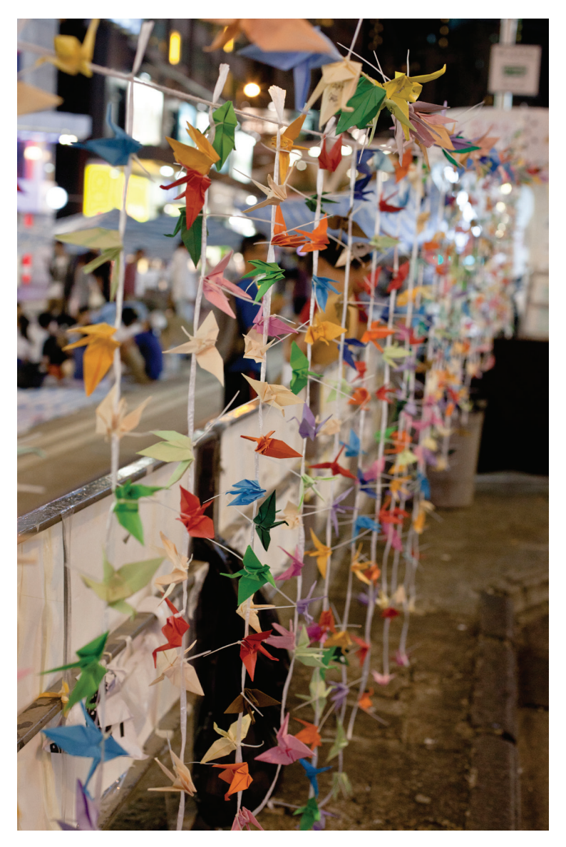
Figure 6: Colourful origami cranes in Causeway Bay, Hong Kong.