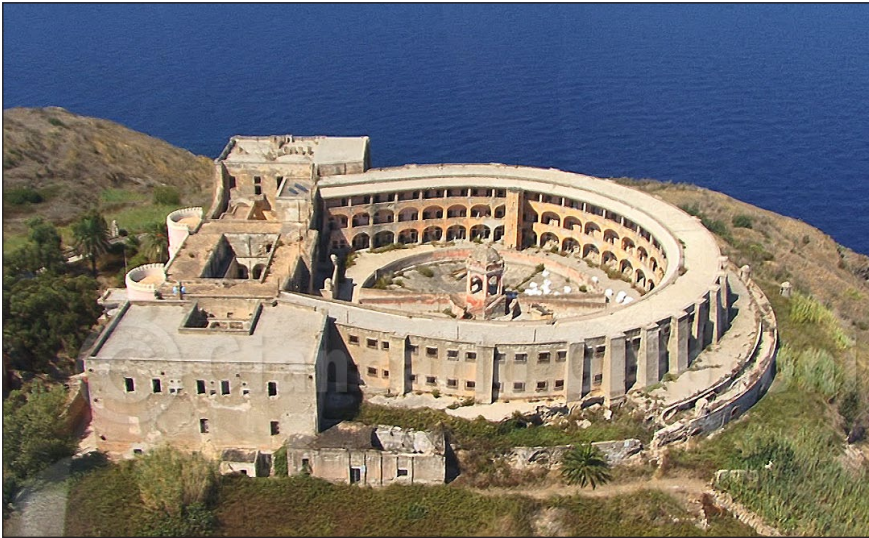
Figure 1 Prison on Santo Stefano Island

During the eighteenth century the Bourbon Kings of Naples proposed the idea of building a prison on the island. King Ferdinand IV was very interested in and supportive of the Enlightenment ideals concerning penology and the rehabilitation of delinquents. The latter would be accomplished by removing delinquents from the contaminated society they were in and placing them in distant and 'clean' environments. In 1793 the King commissioned the architects Winspeare and Carpi to construct a gaol on Santo Stefano (Parente 1998; Pepe 1999).