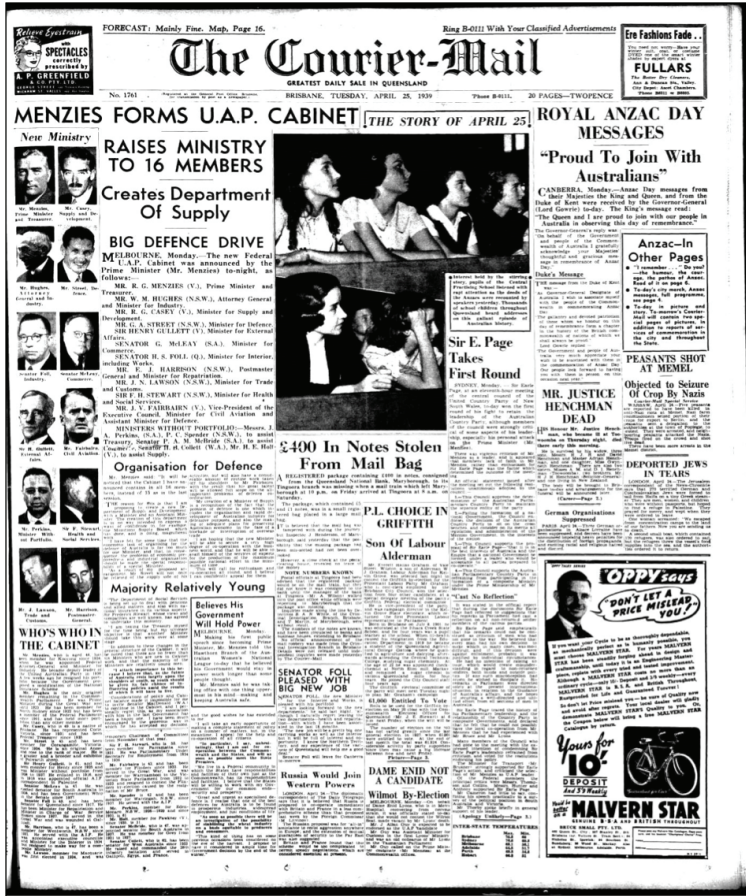
Figure 4: Anzac Day 1939 (The Courier-Mail Brisbane 25 April 1939: 1)