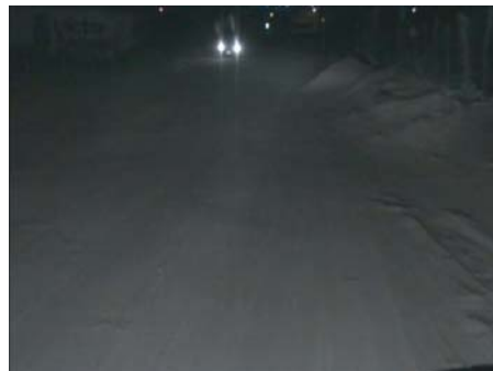
Figure 16 Teresa Margolles Lote Bravo, Lomas de Poleo, Anapra y Cerro de Cristo Negro, 2005 Video Stills of video (4 images)