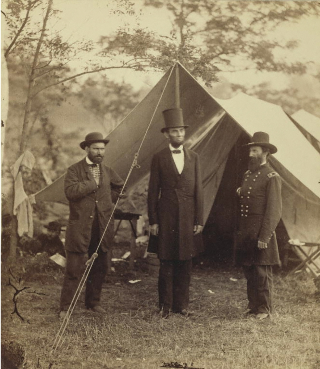
President Lincoln flanked by his generals at the height of the American Civil War in 1862.

The visual rhythm of what was a retrieved symbol of 19 th century steam power is seen as almost metaphorically representing the spirit of Roosevelt and his predecessor Lincoln being pulled across the state and timelines of history, with the American people lining the tracks in respectful vigil. The trilbies and fedoras of 1945 America could be the top hats and bowlers of 1865.