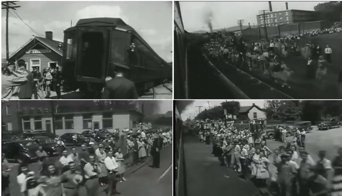
Stills from newsreel reports by Movietone and United News of President Roosevelt’s funeral train escorted by his widow Eleanor Roosevelt who would recall The Lonesome Train when viewing the track-side vigil of American citizens in 1945.

The political and cultural ritual of the powerful steam locomotive crossing state lines in the final journey home for the President of the United States is recaptured when viewing cinema newsreel archive of the event by Movietone (FDR funeral 1945) and United News (Funeral of President 1945).