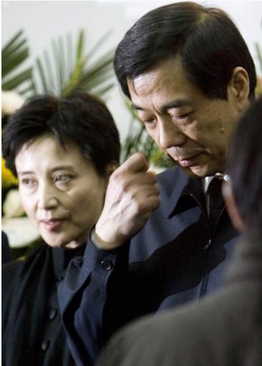
Bo Xilai and his wife, Gu, at the funeral of Bo's father.